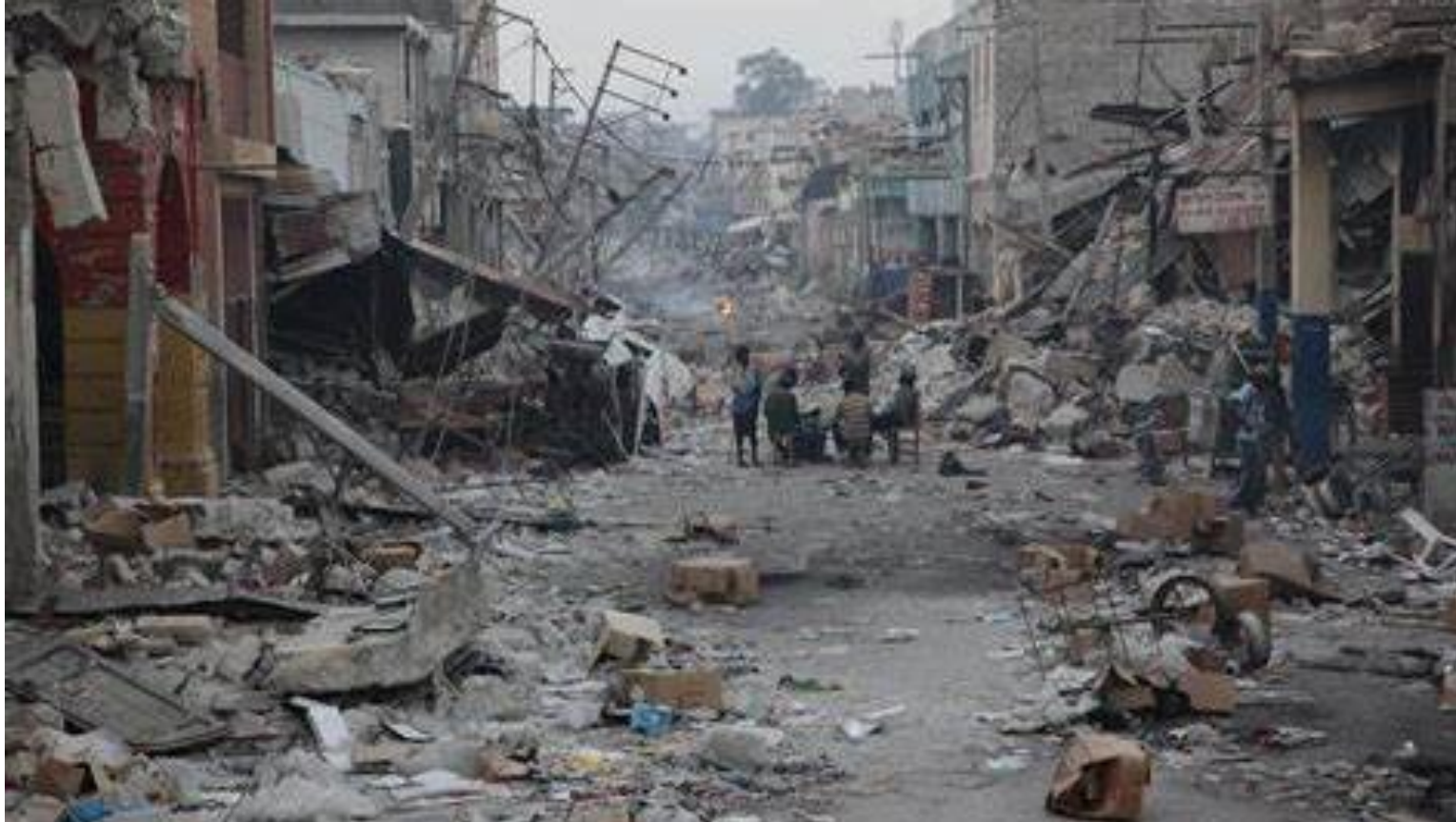
2010 Haitian earthquake